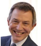
Spencer Pitfield Leadership Fellow

Encompassing eight college campuses, a multi-academy trust and a charitable foundation.