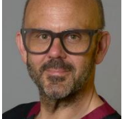
Steve Hams Leadership Fellow

Responsible Business & Impact Senior Vice President (Global) Cielo Talent