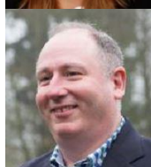
John May Leadership Fellow

Supporting the communities surrounding our Armed Forces.