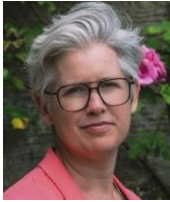
Ruth Marvel Leadership Fellow

Chief Executive Officer, The Duke of Edinburgh's Award