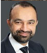
Arun Birla Leadership Fellow

Second Managing Partner & Tax Partner, Paul Hastings