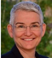
Arlene McDermott Leadership Fellow

Head of Business Management Group Legal & Chief of Staff, Group General Counsel, London Stock Exchange Group