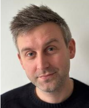
Clark Denman Leadership Fellow