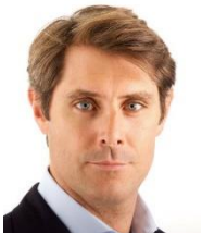
Ben Roome Leadership Fellow

Chief Executive Officer, Digital Mobile Spectrum Ltd