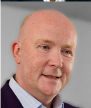
MOK O'Keeffe Leadership Fellow

Director, Asia and Americas, Westminster Foundation for Democracy, dedicated to supporting democracy around the world