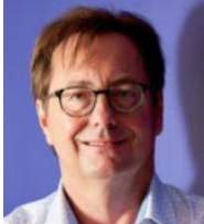
Mike Danby Leadership Fellow

Chief Operating Officer and Deputy Chief Executive, The Yorkshire and Humber Academic Health Science Network