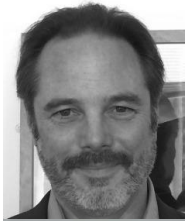
Andrew Balfour Leadership Fellow

Legal Director & Company Secretary, Euronet Payment Services at Euronet Worldwide