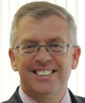
Jarl Severn Leadership Fellow

Award-winning video production and animation