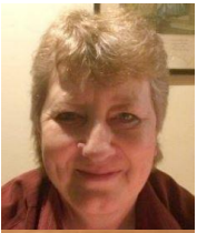
Helen Wilson Leadership Fellow

Head of Human Resources, The Duke of Edinburgh's Award