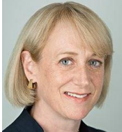
JC Townend Leadership Fellow

Social care, mental health, domestic abuse services in British Sign Language