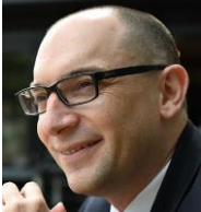
Dan Wood Leadership Fellow

Thought leader and specialist in diversity and creating inclusive cultures