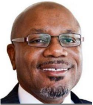
Miles Davis Leadership Fellow

Chief Executive, The British Red Cross Helping people in crisis get the support they need