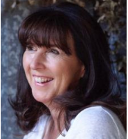
Kay Allen Leadership Fellow

Agent of Change for Nature, Mental Health and Wellbeing