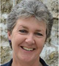
Helen Baker Leadership Fellow

Global leader in assurance, tax and advisory services