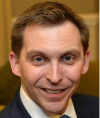
Andy Cole Leadership Fellow

Advancing and promoting excellence in the sales profession