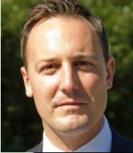
Bradley Smith Leadership Fellow

Co-founder, The Allbright Group Network that champions women to inspire change through members' clubs, an academy and live events