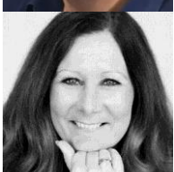
Marnie Millard Leadership Fellow

Professor of Computer Science, Goldsmiths, University of London