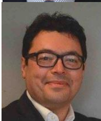
James Edgar Leadership Fellow

Director of Workforce and Organisational Development, Hertfordshire, Bedfordshire and Luton Clinical Commissioning Group