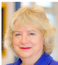
ALISON Peacock (Dame)

A unique law firm specialising in complex, often international family law