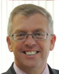
Jarl Severn Leadership Fellow

Chief Executive Officer, Market Research Society